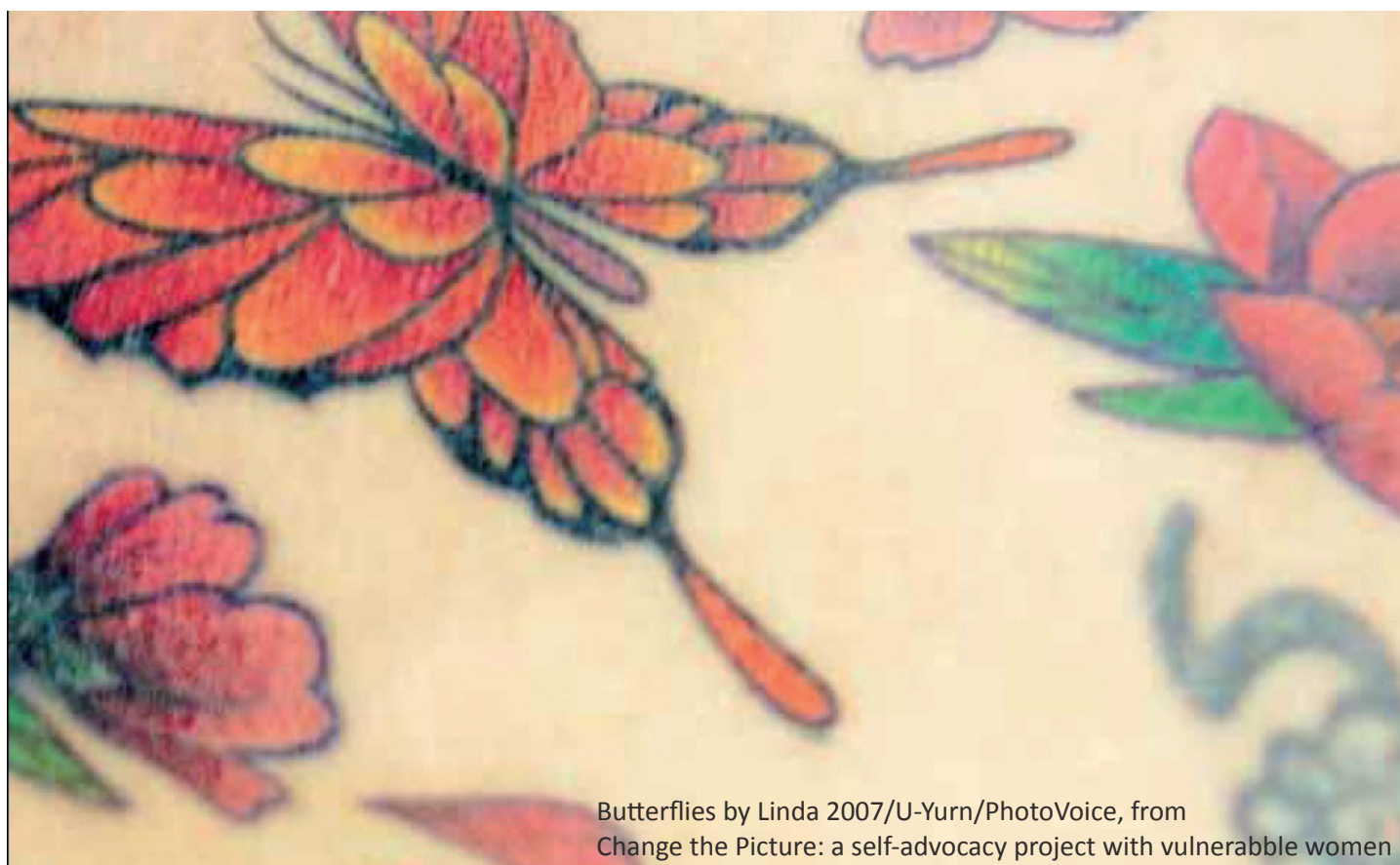
Butterflies by Linda 2007/U-Yurn/PhotoVoice, from Change the Picture: a self-advocacy project with vulnerable women