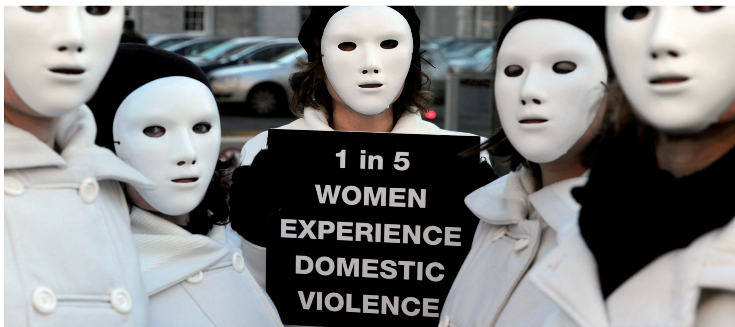
Women's Aid Campaign, Ireland

Domestic violence and poverty and social exclusion are highly gendered phenomena and must be interpreted within the broader social framework of gender inequality and traditional power relations between women and men. When addressing domestic violence against women, the links between women's marginalisation and male violence must be recognised and systematically addressed if we are to tackle the root causes of violence against women. Within this framework, the support system must not only provide women with adequate psychosocial support but aim to provide those opportunities that will help women regain control over their lives and live in dignity free from violence.